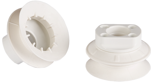
Suction Cups for Flow Grippers SFG